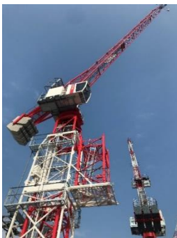
Always one crane length ahead: the new hydraulic WOLFF 133 B luffing jib