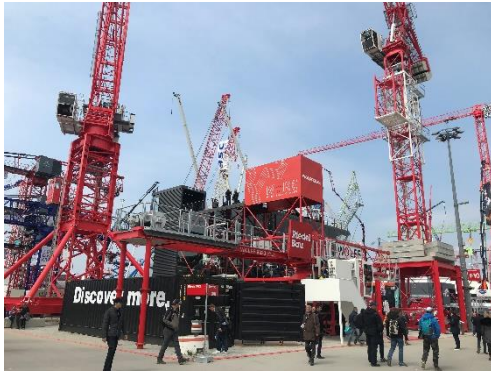
The WOLFFKRAN exhibition stand at the bauma 2019