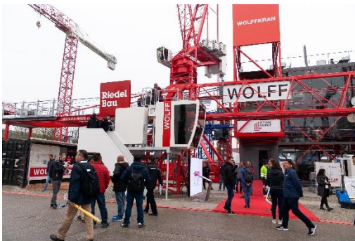
At the WOLFFKRAN stand bauma visitors could climb the WOLFF 6020 clear