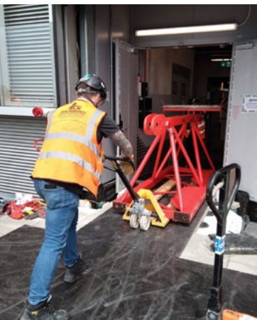
The Derrick Crane was disassembled into 28 parts, 18 of which were brought down by elevator and 10 by BMU.

With the acquisition of the Terex CDK 100-16, WOLFFKRAN has solidified its position as a leading provider of innovative lifting solutions. Clients now have access to a crane that offers unprecedented flexibility and efficiency for tower crane dismantling and various other construction tasks. WOLFFKRAN invites interested parties to explore the possibilities presented by the CDK 100-16 and discover tailored solutions that meet