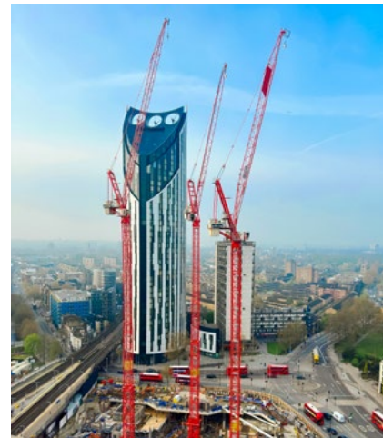
WOLFF 355 B Tower Cranes are working on constructing Elephant & Castle in London.

We are excited about the possibilities these new cranes will bring to your projects, and we look forward to seeing them working on our client's sites across the country.