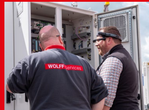
With WOLFF Assist you can transmit your field of vision directly to one of our service experts via Smart-Glasses. They will support you via video call, chat, and screen sharing in solving the problem.

The event provided valuable networking opportunities and the potential for exciting collaborations in the future. We are grateful to all who visited our stand and contributed to our success at Vertikal Days.