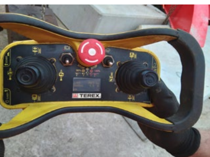
Derrick Crane can be easily controlled with a remote control.